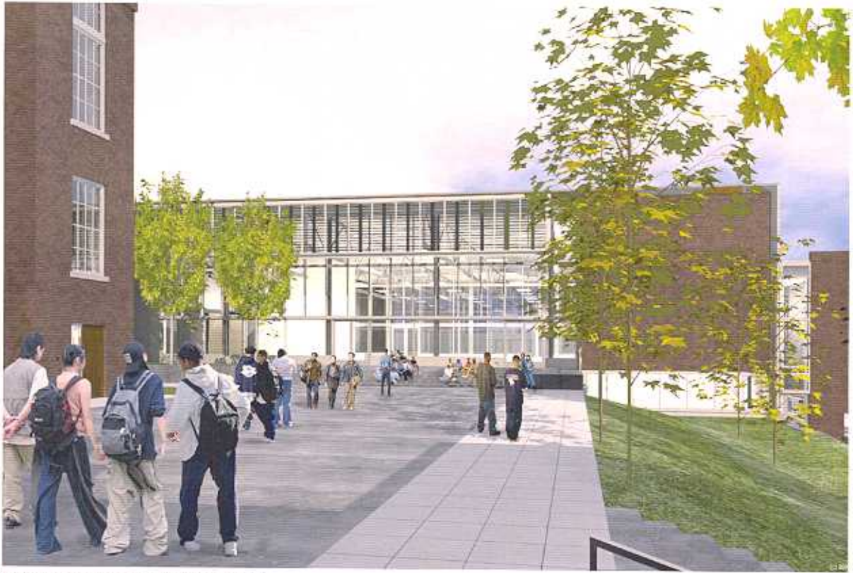
Commons Building from North Courtyard