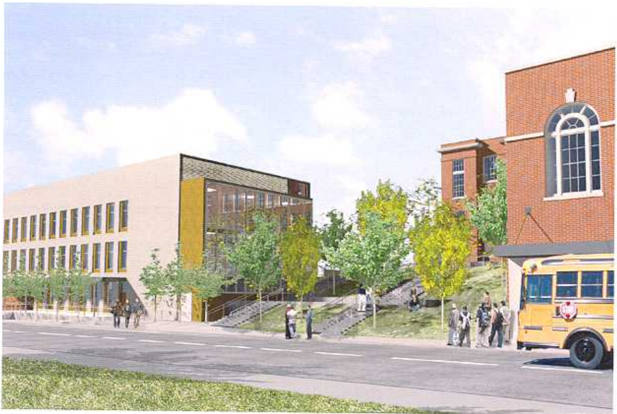
New Classroom Building and South Courtyard

INFORMATION ON THIS PROJECT CAN BE FOUND ON THE SEATTLE SCHOOL DISTRICT WEBSITE: www.seattleschools.org/area/facilities/SchoolProjects/ClevelandLink.xml