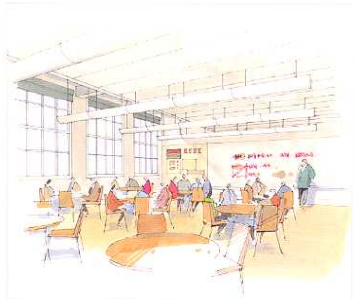
Classroom in Historic Building