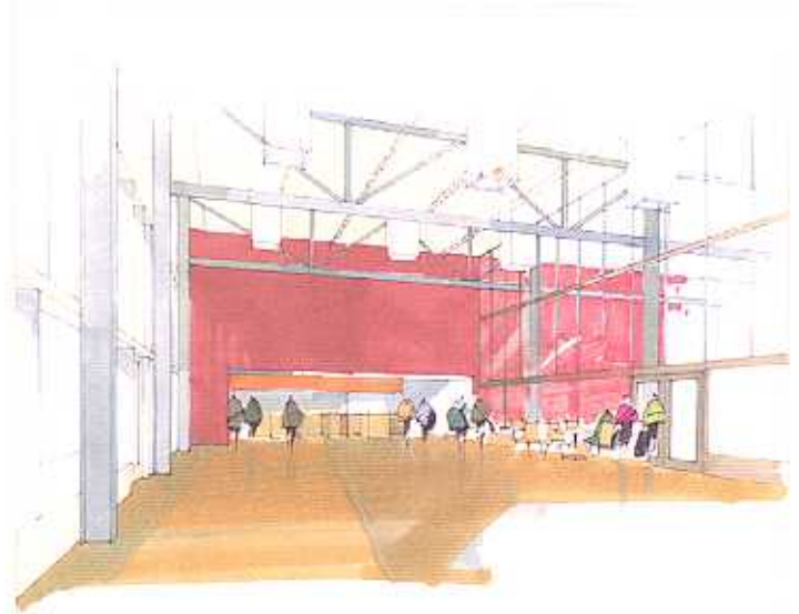
Commons and Server

This project is funded through Seattle School District's Building Excellence II program.